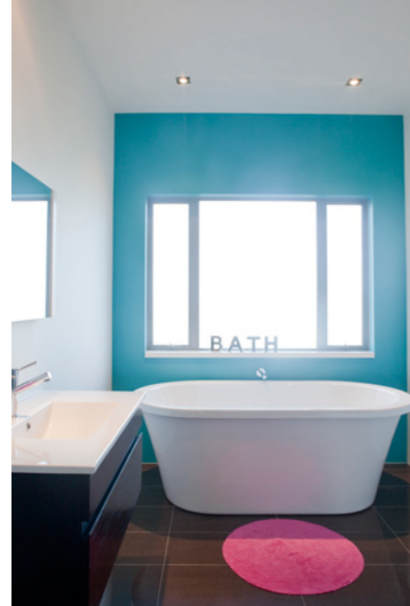
ABOVE Lisa felt that the main bathroom looked a little bland with white walls, so painted a feature wall in Resene Hullabaloo after the home had been completed. ABOVE RIGHT The ensuite bathroom has an elegant style, with a feature chandelier matching the one in the master bedroom and chocolate brown tiles.

the United Kingdom to place beneath the centre island and behind the glass splashback. As part of the aesthetic appearance of the kitchen, the sink in the centre bench was strategically centered beneath the large skylight, which is a feature Lisa loves.