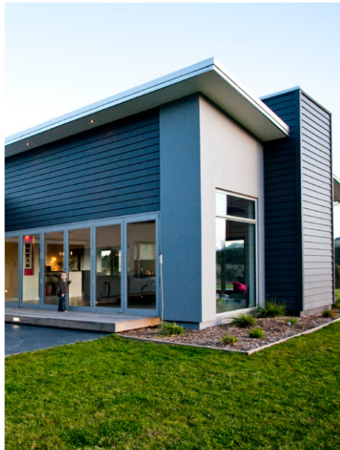
The property is only minutes from the local village, but boasts a distinctly rural setting. There are other homes nearby, but the large section allows the children plenty of room to explore.